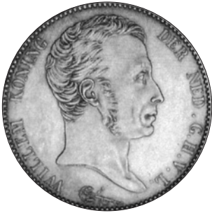
King William I on a 3 guilder piece from 1817.

In this, the third and final volume of the Times of Turmoil trilogy, the author has analysed the historical and philatelic consequences of the ill-fated union between the northern and southern low countries, The Netherlands and Belgium and the third partner, Luxembourg. The creation of the Kingdom of the United Netherlands was strongly endorsed by the victorious allies in the Vienna Congress. This early Benelux was seen as a northern buffer to thwart future expansionist ideas by France, which had seen a return of the Bourbon royals following the reign of Napoleon I.