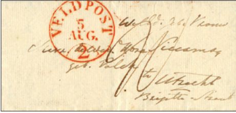
Field post from the battle zone to Utrecht. prized by collectors and various examples are shown. A compendium of these markings is included in the catalogue (Chapter 21).

Following intervention by French forces the Dutch retained only their Citadel stronghold near Antwerp but surrendered 23 December 1832 following a siege. Commandant Chassé and his force then spent some time in the prisoner of war camp St. Omer. Letters from this period include one from Chassé sent to Holland by gunboat over the Scheldt.