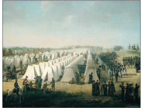
Army camp near Rijen.

Following intervention by French forces the Dutch retained only their Citadel stronghold near Antwerp but surrendered 23 December 1832 following a siege. Commandant Chassé and his force then spent some time in the prisoner of war camp St. Omer. Letters from this period include one from Chassé sent to Holland by gunboat over the Scheldt.