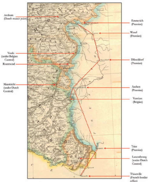
Map showing the various postal focus points.

The lengthy political quagmire created a postal historian's paradise and this volume describes in detail the historical and philatelic aspects. Following the revolt in the summer of 1830, direct connections between north and south were severed yet soon the mail made it through anyway as Prussian forwarders created new postal routes. International connections too were quickly restored.