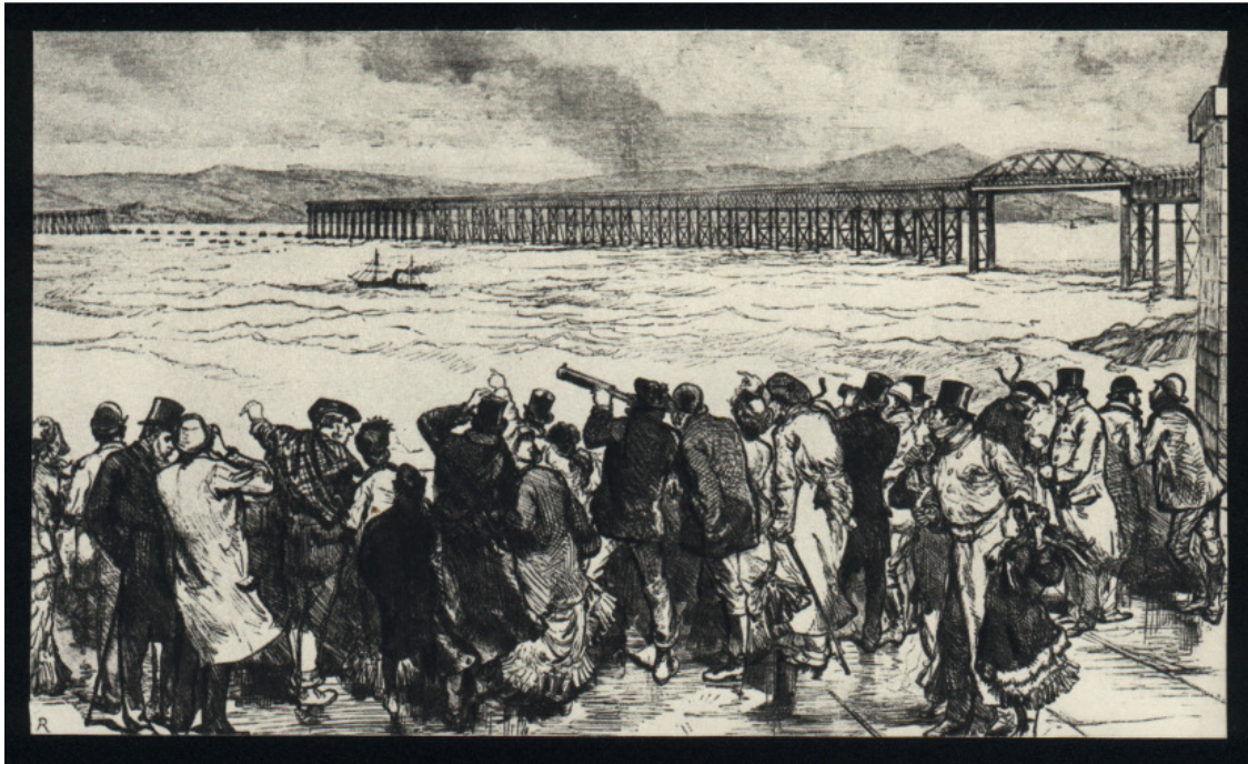
Onlookers at the Tay Bridge Disaster 1879