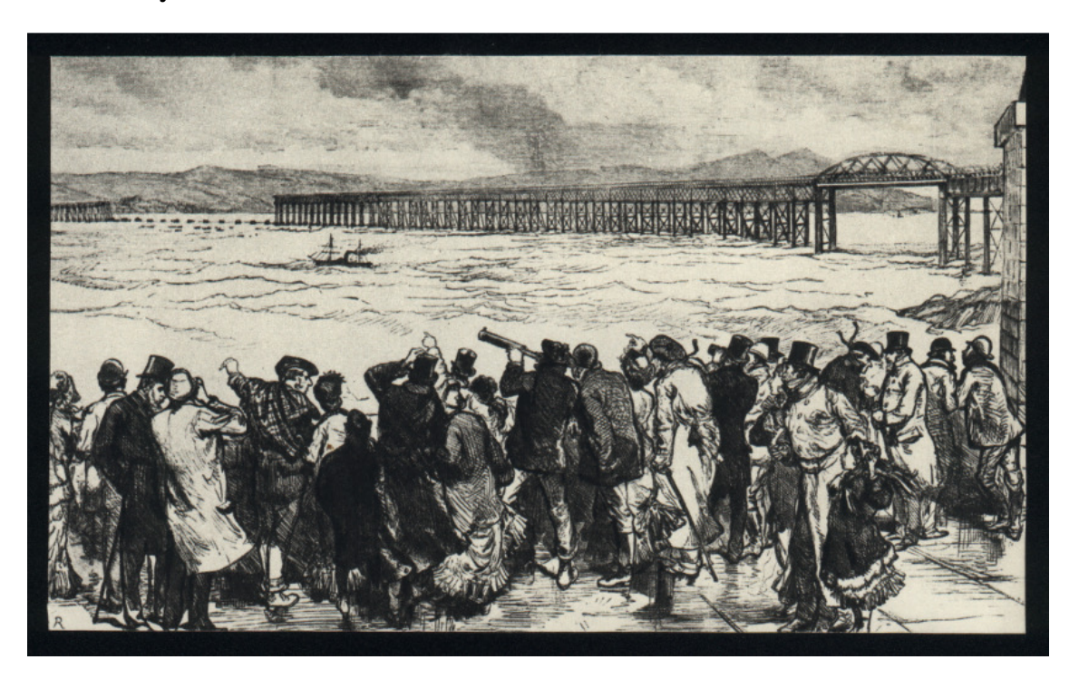
Onlookers at the Tay Bridge Disaster 1879