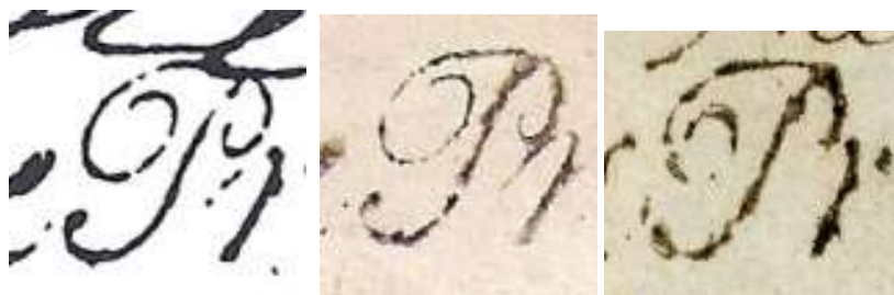
Figure S1. LP 7 varieties involving letter P (enlarged).

Variations due to damage, repair or replacement have been seen in the shape of the letter P in handstamp LP 7. The top can be round or flat and the loop large or small (Figure S1). Larger loops and round tops seem to be associated with early examples.