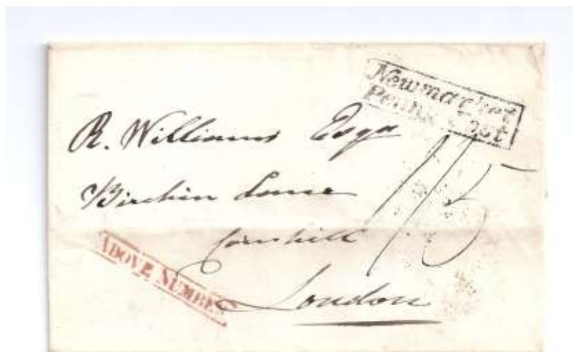
Figure S3. Entire dated 5 April 1835 with LN 8 handstamp in red ink.

Originally included as Colour not stated