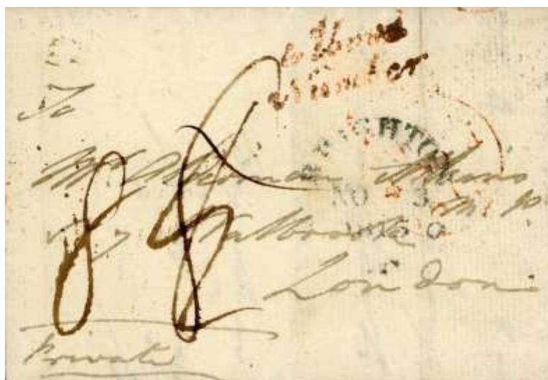
Figure S2. Entire dated 3 November 1815 with LN 4 handstamp in red ink.